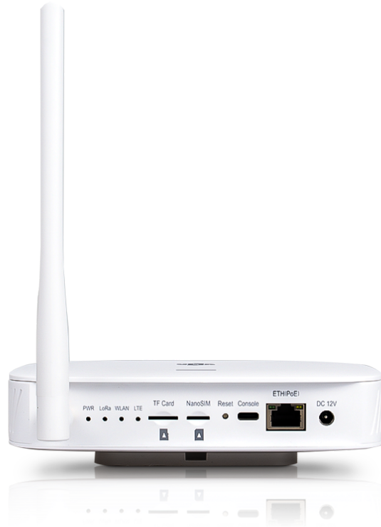
Figure 2: RAK7268/C WisGate Edge Lite 2 Back Panel