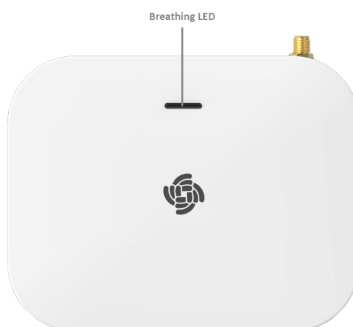
Figure 1: RAK7268/C WisGate Edge Lite 2 Top View